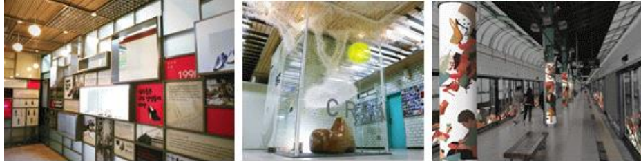
Fig. 2. Exhibition in Seongsu Station

cently been updated and revitalized, but this renovation failed to utilize the unused space between floors.