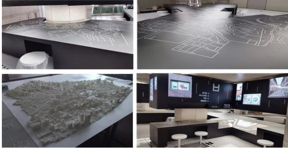
Fig. 7. Three-dimensional models for exhibition in the Gasan Digital Complex Station