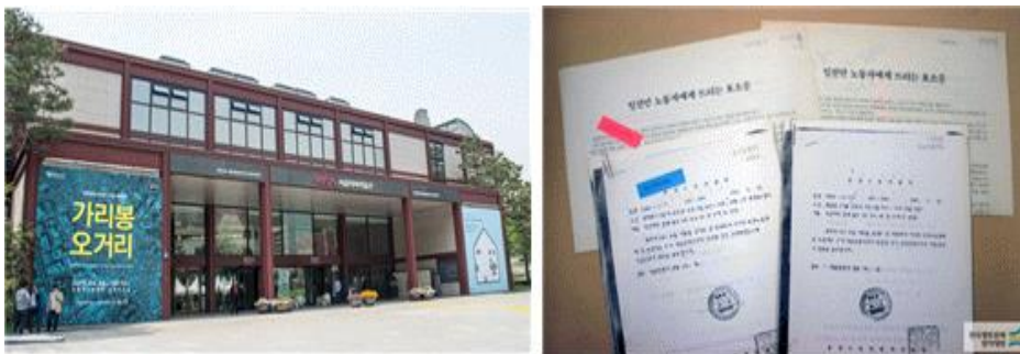
Fig. 4. Exhibition area at the Gasan Digital Complex Station

As it is called the Guro Industrial Complex, it is commonly believed to be located in the Guro district, not the Geumcheon district of Seoul. Much previous research into the changes and lives of laborers in the region has been conducted, and several areas have been featured in movies or the mass media. Moreover, meaningful data from the previous ‘Garibong 5-way intersection’ exhibition and the book ‘Garibong-dong’, which is currently preserved in the history museum, are available.