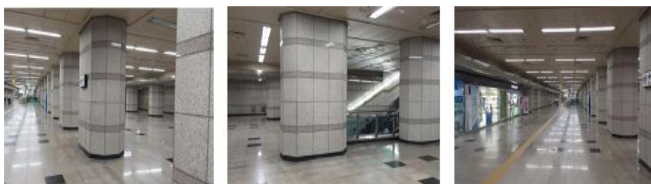
Fig. 1. Condition of the Gasan Digital Complex Station

The objective of this research is to provide a practical direction for the use of underground space between floors in subway facilities, which is regarded as wasted space in the city of Seoul.