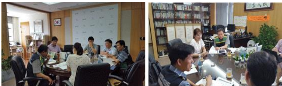
Fig. 5. Meetings at Geumcheon-gu

Determining appropriate items for inclusion in the ‘exhibition space’ that embody the historical and industrial changes of the ‘Geumcheon’ district is problematic. To clarify, embodying the visual expressions of diverse backgrounds and age groups and presenting this in an objective manner is difficult. Numerous meetings and discussions were held to select the contents of the exhibition; these resulted in creation of a dictionary called [Ninety nine].