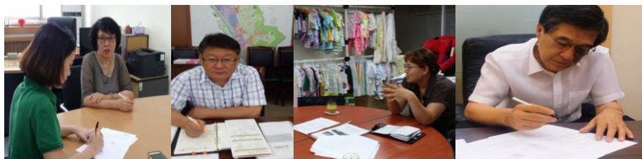
Fig. 8. Interviews by surveyors

The meetings strengthened the list of 99 words and clarified the direction of the exhibition; however, concerns regarding the objectivity of the exhibition remained. Therefore, a 3-week process of interviewing 23 people (regional activists, public office workers, long-term residents and business people.) with memories of G-valley was conducted. During this process, the 99 words that had been selected were further curated to take on even more significant meanings.